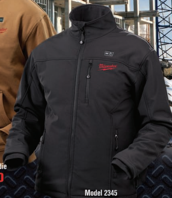
Model 2345 Black Heated Jacket