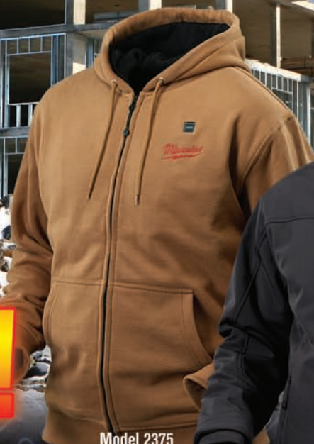
Model 2375 Khaki Heated Hoodie

M12™ Heated Jackets and Hoodies feature three adjustable heat settings that provide the right amount of heat to the hands, core and upper back. Durable carbon fiber heating elements distribute heat to core body areas and pockets. Versatile battery holder features a battery fuel gauge and built-in USB port to charge phones and other portable electronics. Powered by the M12™ REDLITHIUM™ battery system for up to 6 hours of continuous heat on a single charge. Comes with M12™ REDLITHIUM™ battery and charger.