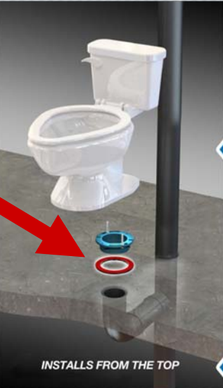
INSTALLS FROM THE TOP