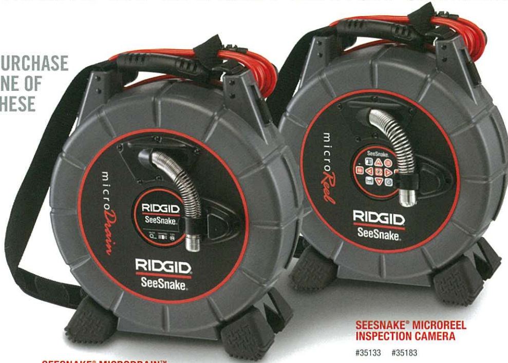
SEESNAKE® MICRODRAIN™ INSPECTION CAMERA #37468