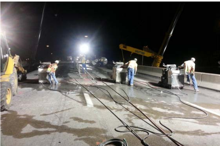
Pro-Cut teams use flat saws to remove a 168-foot long span of the bridge deck