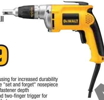
DW272 4,000 rpm VSR Drywall Scrugun