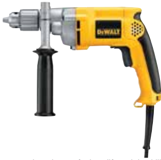
DW235G 1/2" (13mm) VSR Drill