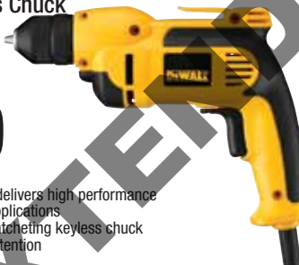
DWD112 3/8" (10mm) VSR Pistol Grip Drill with Keyless Chuck