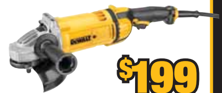
DWE4557 7" 8,500 rpm 4.7 HP Angle Grinder