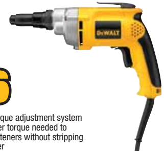
DW269 1,000 rpm VSR VERSA-CLUTCH™ Scrugun