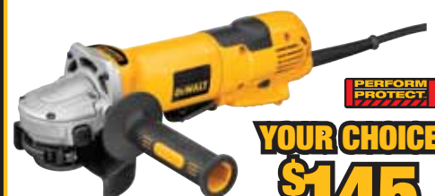
D28131 4-1/2" - 5" High Performance Grinder