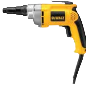
DW268 2,500 rpm VSR VERSA-CLUTCH™ Scrugun