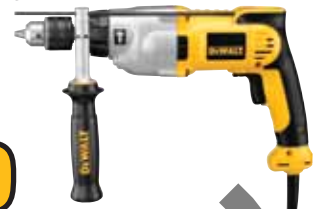
DWD520K 1/2" VSR Pistol Grip Hammerdrill Kit