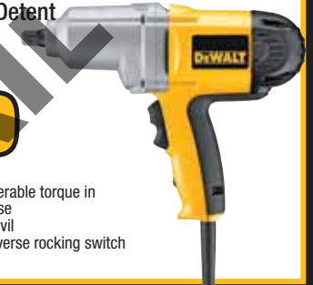
DW292 1/2" (13mm) Impact Wrench with Detent Pin Anvil