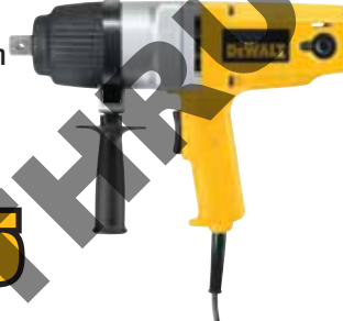
DW297 3/4" (19mm) Impact Wrench