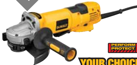
D28140 6" High Performance Cut-Off/Grinder