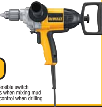
DW130V 1/2" (13mm) Spade Handle Drill