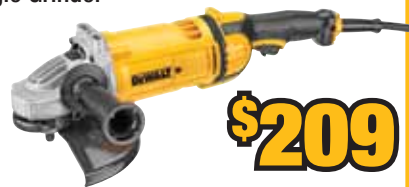
DWE4559N 9" 6,500 rpm 4.7 HP Angle Grinder No-Lk