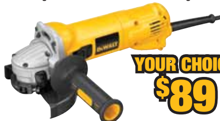
D28402 4-1/2" (115mm) Small Angle Grinder