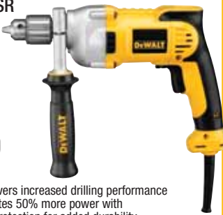
DWD210G 1/2" (13mm) VSR Pistol Grip Drill