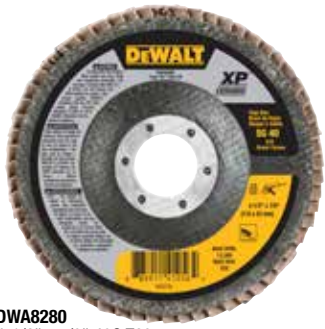
DWA8280 4-1/2" x 7/8" 40G T29 XP™ CER FLAP DISC