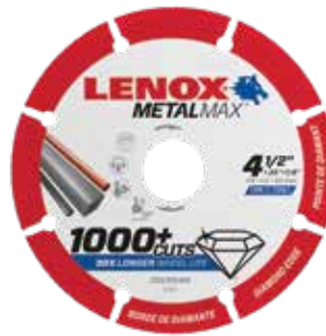
1972921 4.5" LENOX® Metalmax™