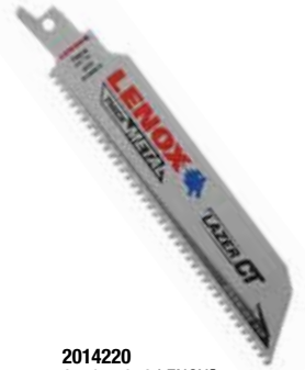
2014220 6 x 1 x .052 LENOX® Lazer CT™ Carbide Tipped Reciprocating Saw Blades

DRIVEKORE TOOLS, SUPPLIES, & SAFETY FOR THE PROFESSIONAL