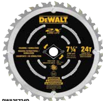
DWA35724D 7-1/4" Demolition Blade