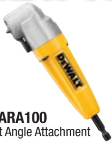
DWARA100 Right Angle Attachment