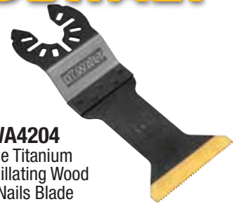
DWA4204 Wide Titanium Oscillating Wood w/ Nails Blade