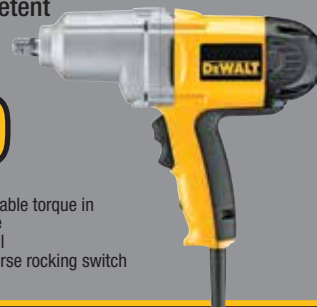
DW292 1/2" (13mm) Impact Wrench with Detent Pin Anvil