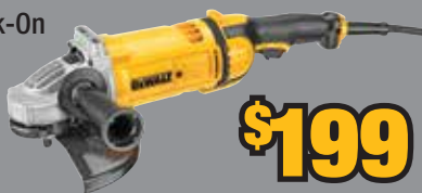
DWE4559N 9" 6,500 rpm 4.7 HP Angle Grinder No Lock-On