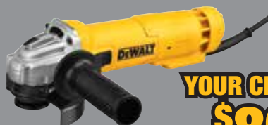
DWE402 4-1/2" (115mm) Small Angle Grinder