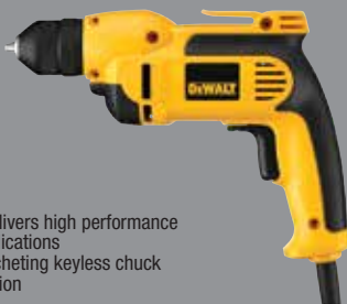
DWD112 3/8" (10mm) VSR™ Pistol Grip Drill with Keyless Chuck