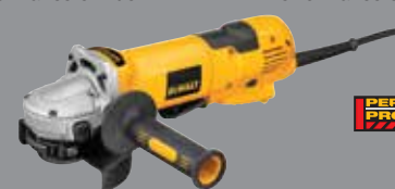
D28131 4-1/2" - 5" High Performance Grinder