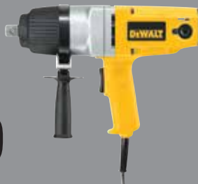
DW297 3/4" (19mm) Impact Wrench