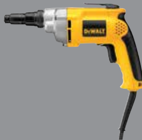
DW268 2,500 rpm VSR™ VERSA-CLUTCH™ Scrugin