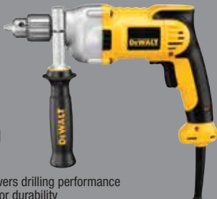
DWD210G 1/2" (13mm) VSR™ Pistol Grip Drill