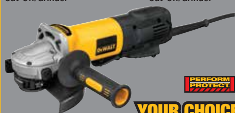
D28140 6" High Performance Cut-Off/Grinder