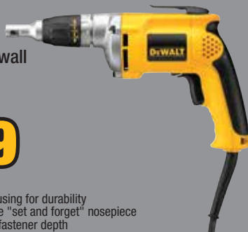
DW272 4,000 rpm VSR™ Drywall Scrugin