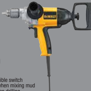
DW130V 1/2" (13mm) Spade Handle Drill