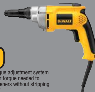
DW269 1,000 rpm VSR™ VERSA-CLUTCH™ Scrugin