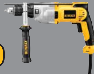
DWD520K 1/2" VSR™ Pistol Grip Hammerdrill Kit