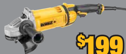
DWE4557 7" 8,500 rpm 4.7 HP Angle Grinder