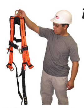
Hold the harness by the back dorsal D-ring. Shake harness to allow all straps to fall into place.